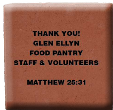
8 x 8 Brick